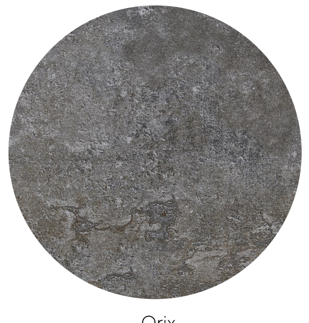
Orix INDUSTRIAL Collection GRIP +