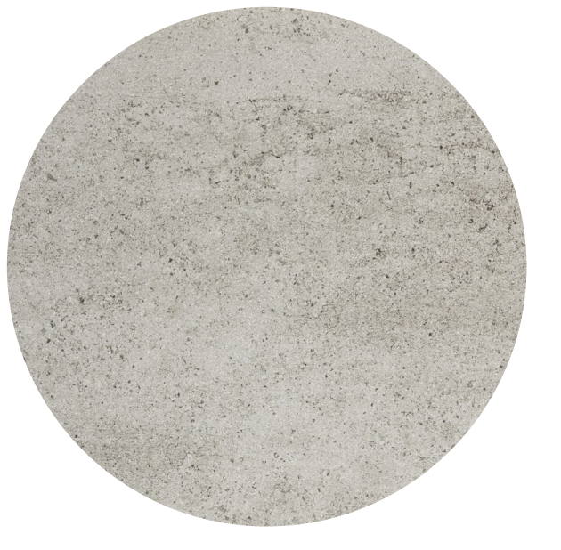
Keon TECH Collection ■ GR-IP +