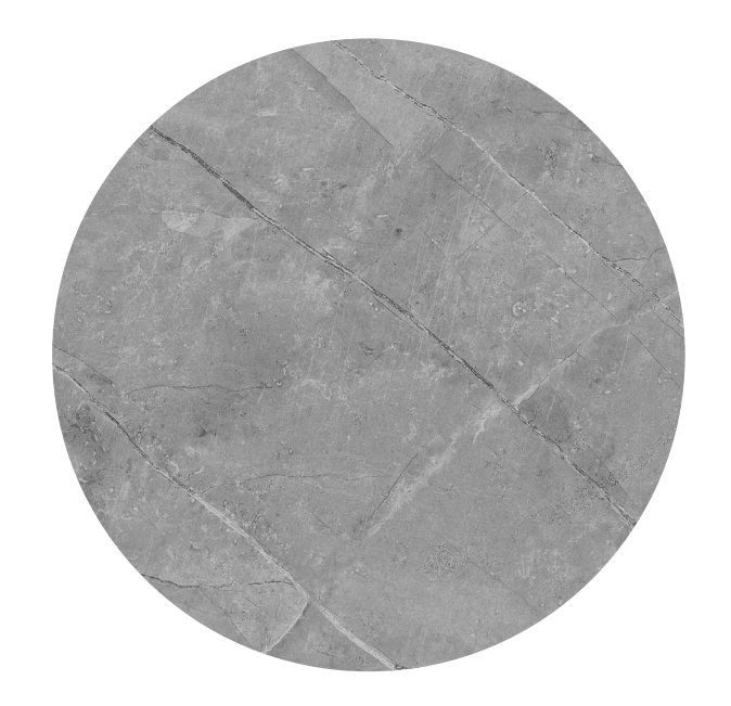
Vera NATURAL Collection ☐ GR-I-P +