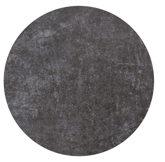
Laos INDUSTRIAL Collection GR-IP +