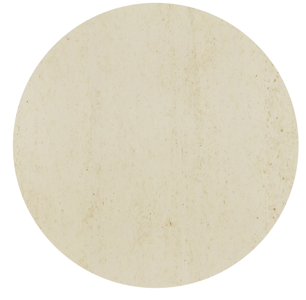
Danae NATURAL Collection ■ GR-IP +