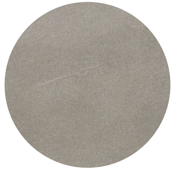
Sirocco NATURAL Collection 回 GRIP 十