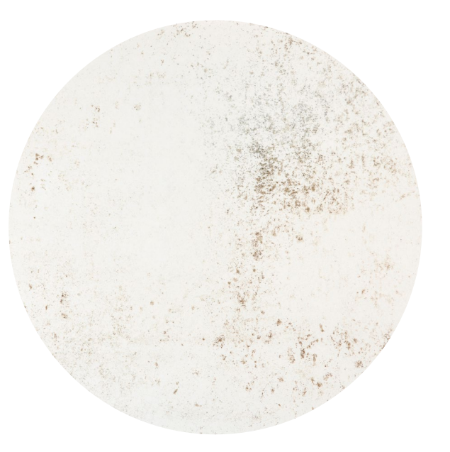
Nilium INDUSTRIAL Collection ☐ GR-IP +