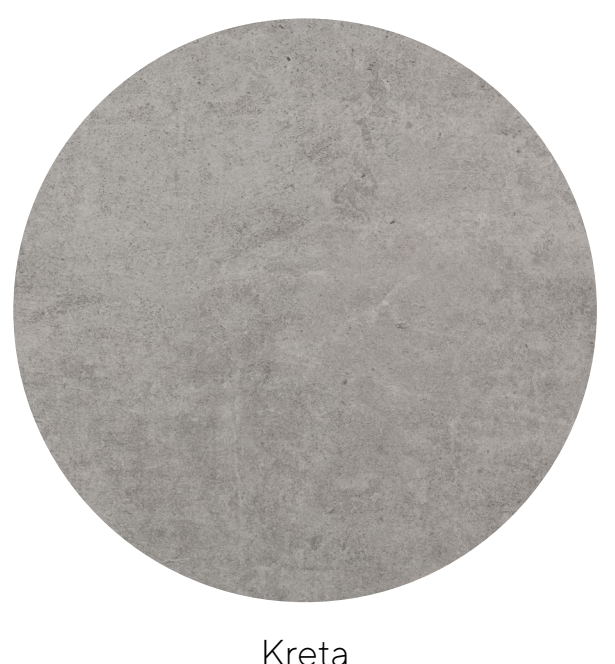
Kreta INDUSTRIAL Collection GR-IP +