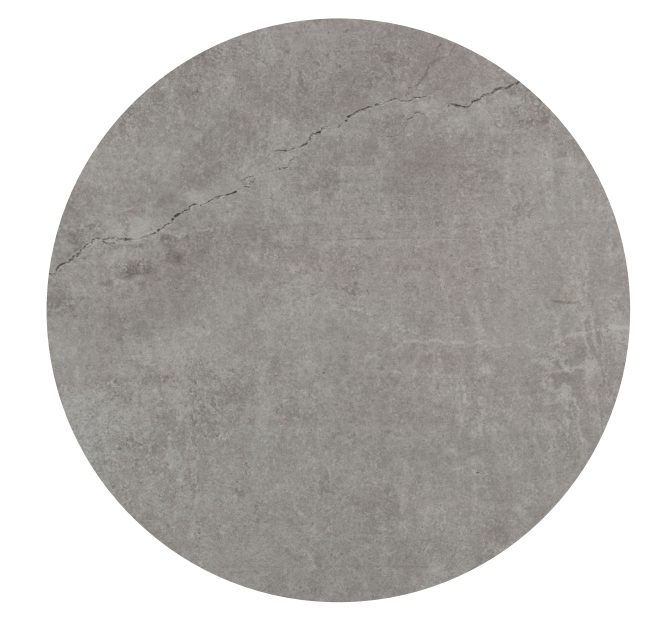
Soke INDUSTRIAL Collection ☐ GR-IP +