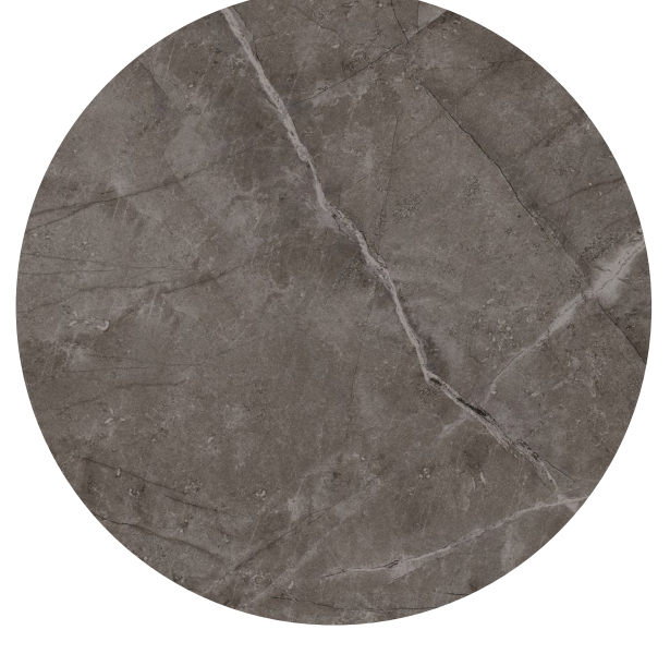
Kira NATURAL Collection ■ GR-IP +