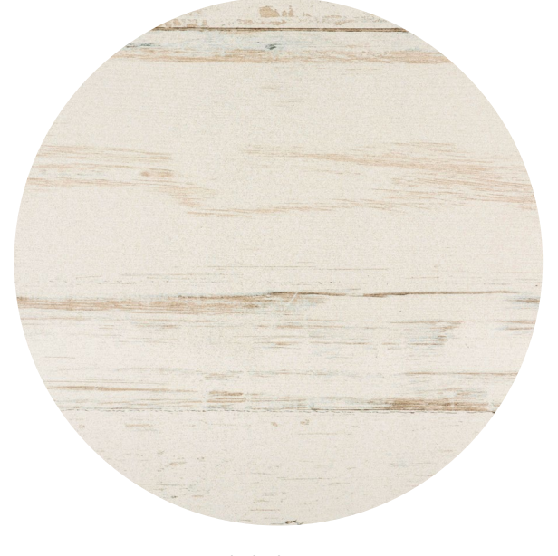
Makai WILD Collection ■ GR-IP +