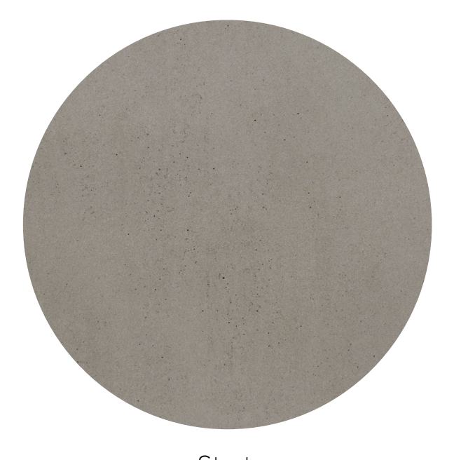
Strato TECH Collection GRIP +