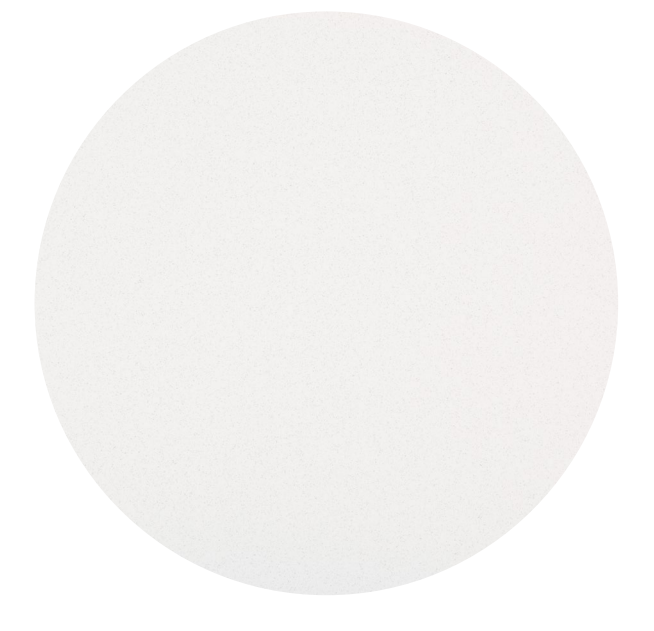
Nayla NATURAL Collection ■ GR-IP +