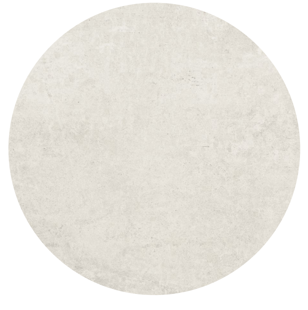
Lunar INDUSTRIAL Collection GR-IP +