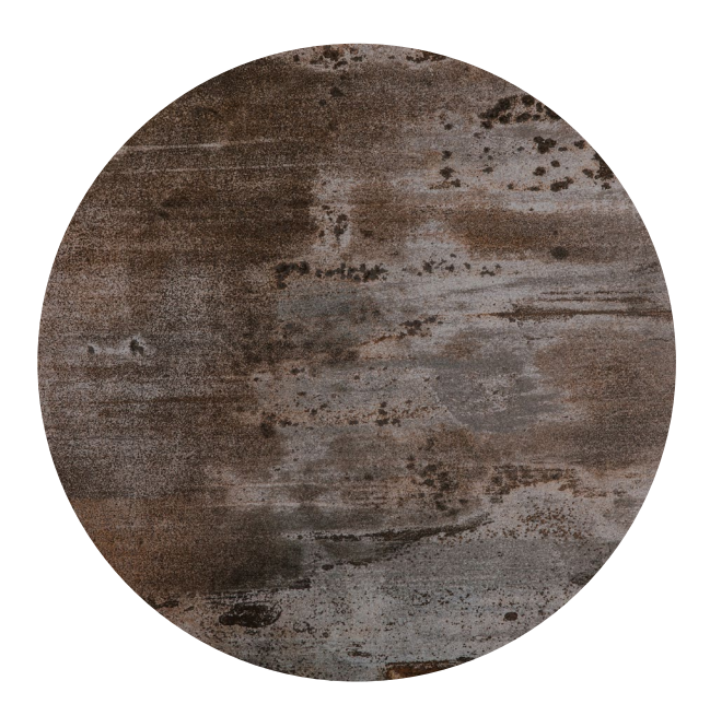
Trilium INDUSTRIAL Collection ■ GRIP +