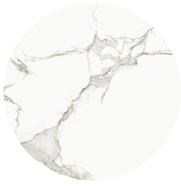
Aura 15 NATURAL Collection GR-IP +