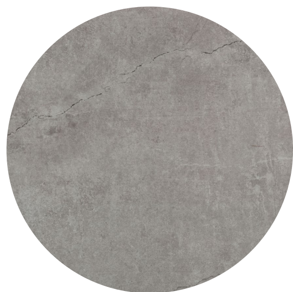
Soke INDUSTRIAL Collection GRIP +