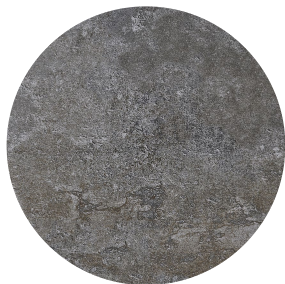
Orix INDUSTRIAL Collection GRIP +