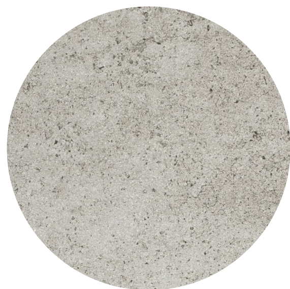
Keon TECH Collection GRIP +

Colours that can be used for all applications (except stairs): Orix,Vera, Soke and Keon