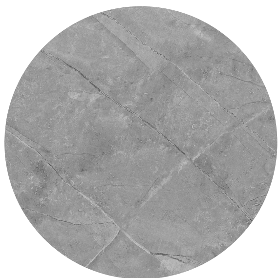
Vera NATURAL Collection GRIP +