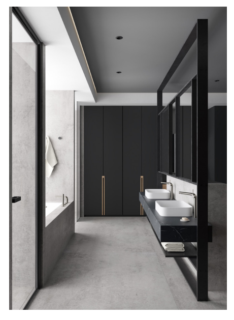
→ Dekton® Kreta.

Any differences in the cleaning of both finishes will be detailed in the corresponding section.