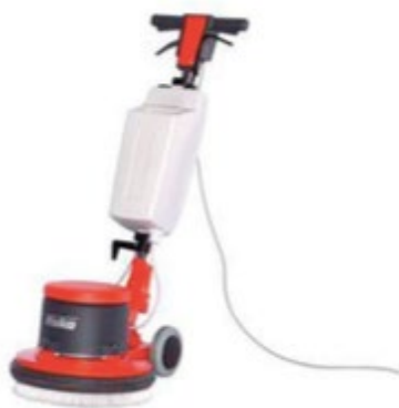
Rotary cleaning machine