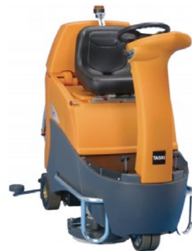
Automatic floor scrubbers